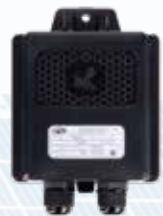
Swarm Data Acquisition Unit