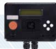
Beehive Data Aggregation Device