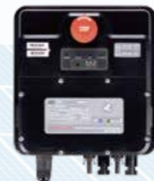
Beebox-H Optimizer Initiator