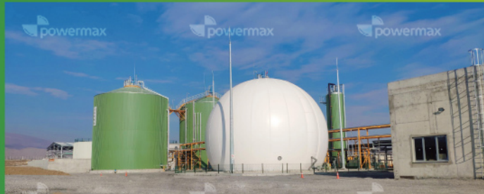
Processing capacity: Kitchen waste 150t/d