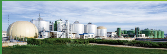
Processing capacity: Chicken manure 300t/d