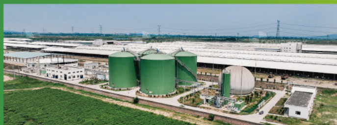
Processing capacity: cow dung 1,000t/d