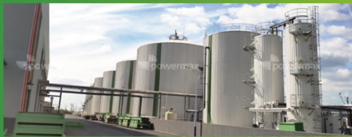
Processing capacity: Kitchen waste 400t/d