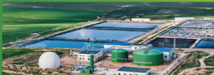
Processing capacity: Pig farm wastewater 900t/d